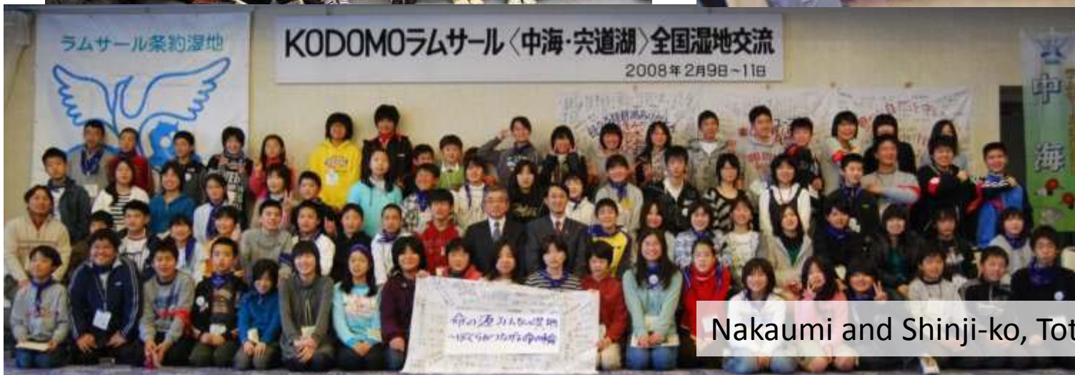
Nakaumi and Shinji-ko, Tottori /Shimane