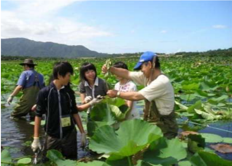
Learning from the fields